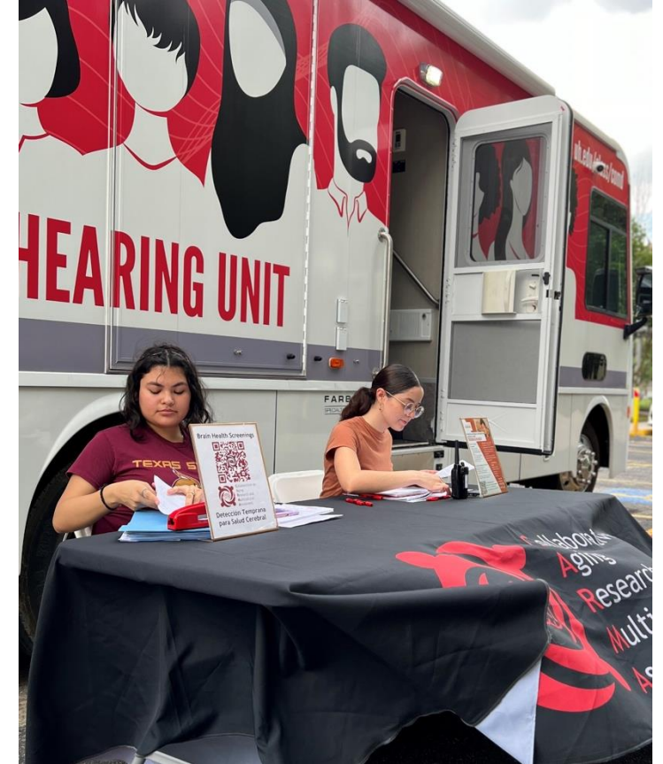
Brain Health Screenings